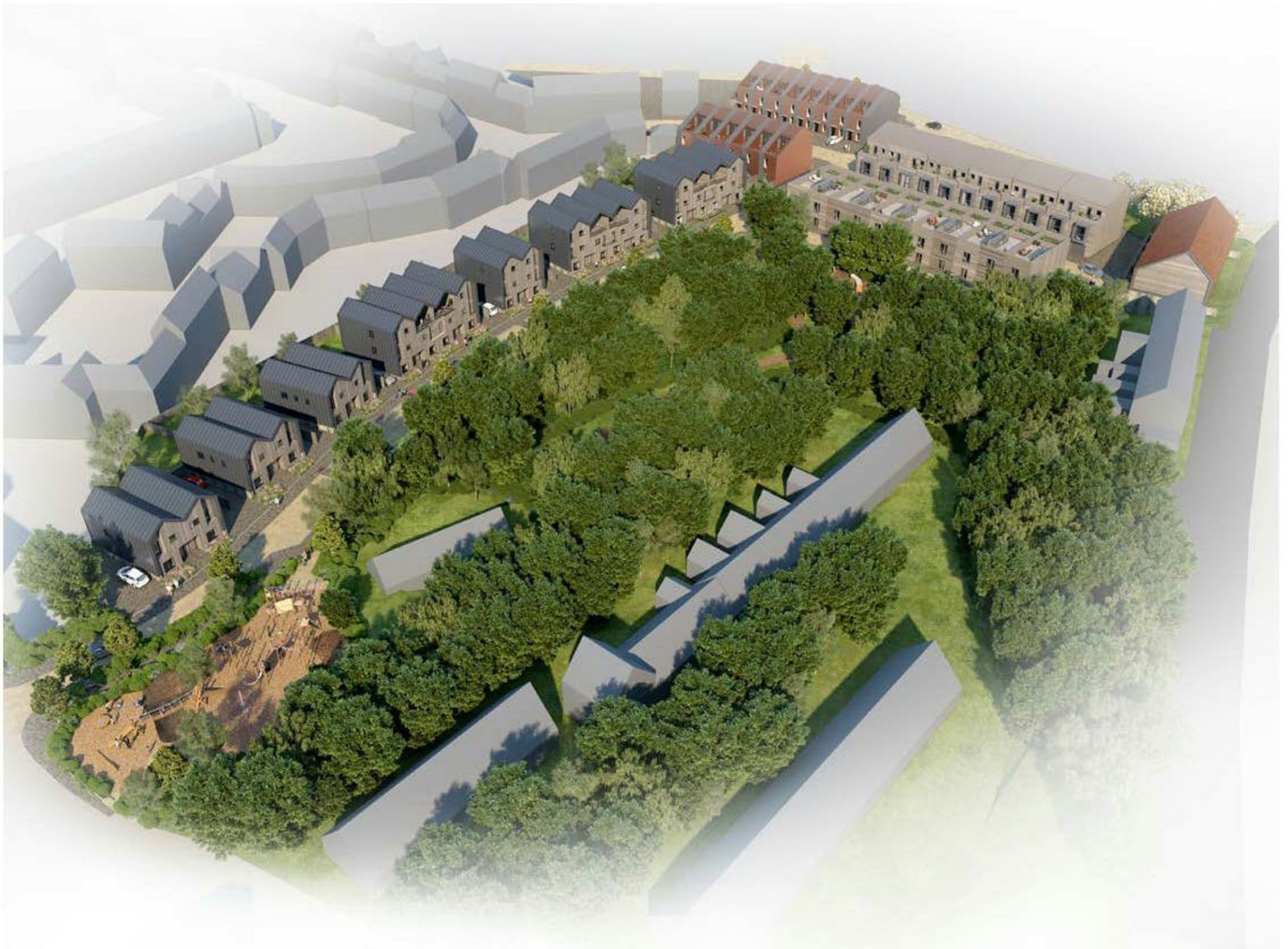
CGI: Birds-eye view of Zone 1A proposals

PCRL has worked closely with the Purfleet Community to develop the masterplan for regeneration of Purfleet. As the first phase of this development, Zone 1A will begin to initiate change for Purfleet, demonstrate PCRL's commitment to delivering high-quality homes and amenity and will set the benchmark for development within the masterplan.